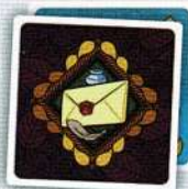
5 SECRET GOALS