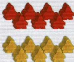
14 DWARF MEEPLES